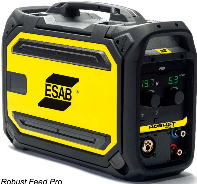
Robust Feed Pro

The Robust Feed, with its ergonomic, robust and enclosed design, is the ideal partner whenever portability and durability are key. Equipped with a new precision wire drive system with enough power to handle up to 2.0 mm solid wire and 2.4 mm cored wire. Offshore variants available with flow meter and heater included. Robust Feed Pro works with Warrior power sources.