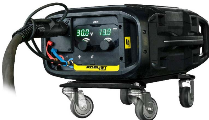
Wheel Kit works with feeder horizontal or vertical