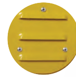
HIGH & LOW LEVEL VENTILATION TO PREVENT BUILD-UP OF FUMES