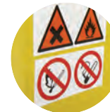
HAZARD WARNING SIGNS