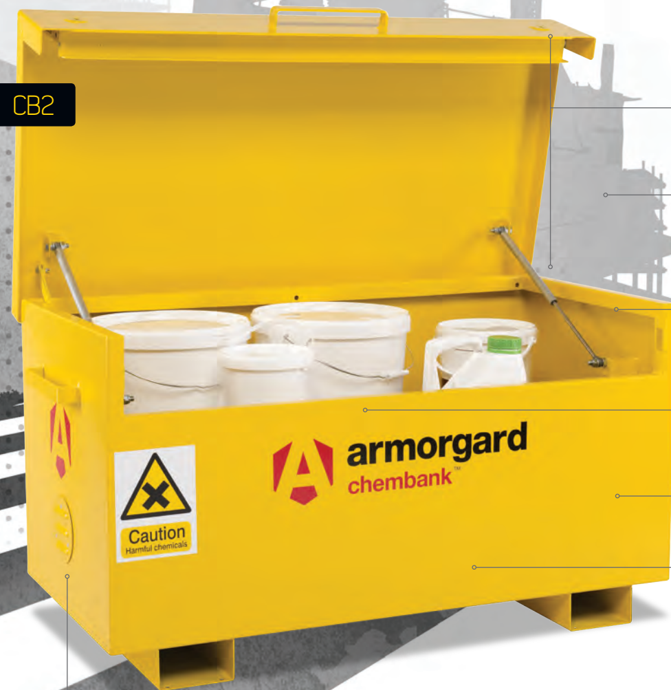
HIGH & LOW LEVEL VENTILATION TO PREVENT BUILD-UP OF FUMES