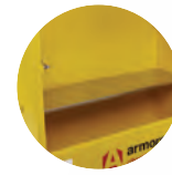
CBC4 MODEL SUPPLIED WITH 1 INTERNAL SHELF